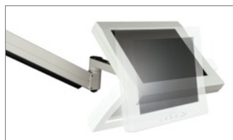
200 degrees of monitor tilt