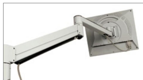
Integrated cable management