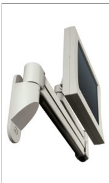
Folds to save maximum space