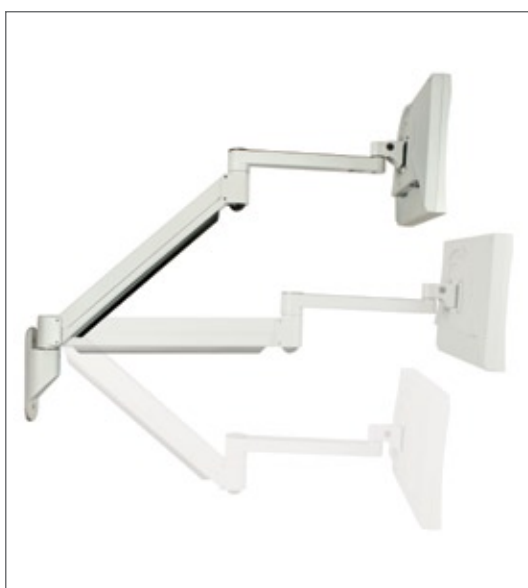
79 cm (31") of vertical range