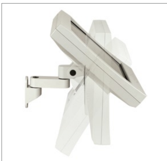
Monitor tilts up and down 30 degrees