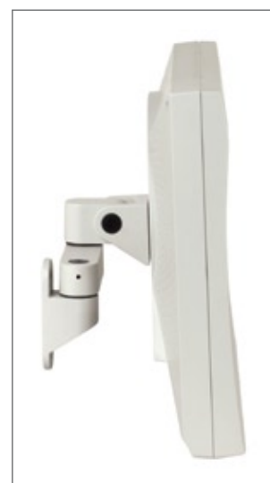
Folds to save maximum space