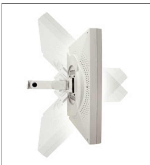
Monitor rotates left and right 30 degrees