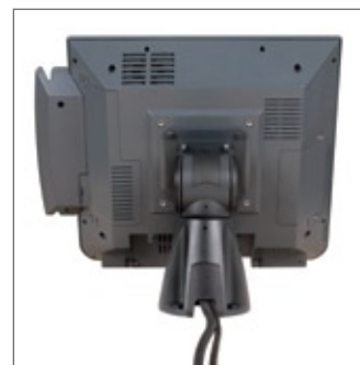
Cables may exit above or below counter