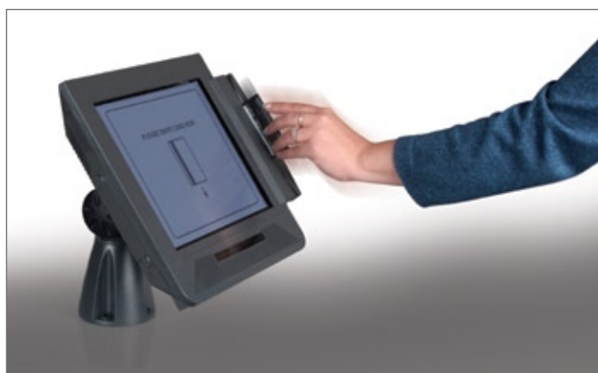
Innovative's clean, attractive POS design conveys a quality image straight through the checkout process