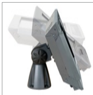
Easily tilt monitor to desired angle