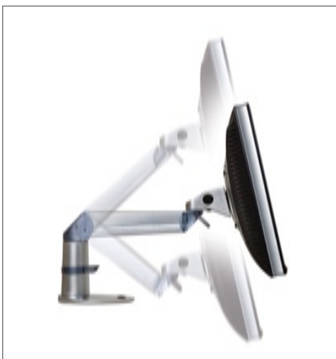
Intuitive adjustment via fingertips