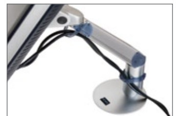
Integrated cable management