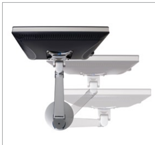
Folds to save maximum space