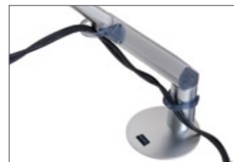
Integrated cable management