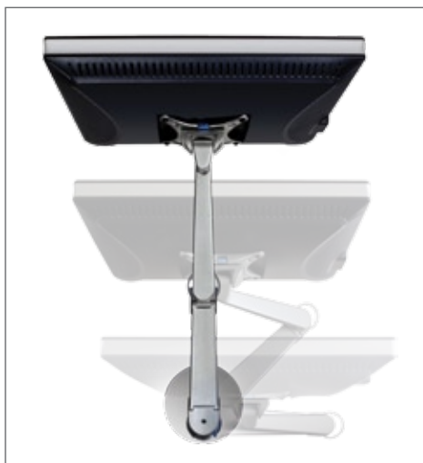
Folds to save maximum space