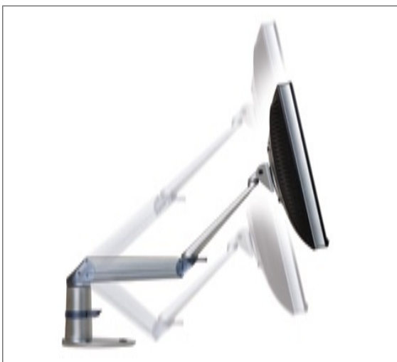
Intuitive adjustment via fingertips